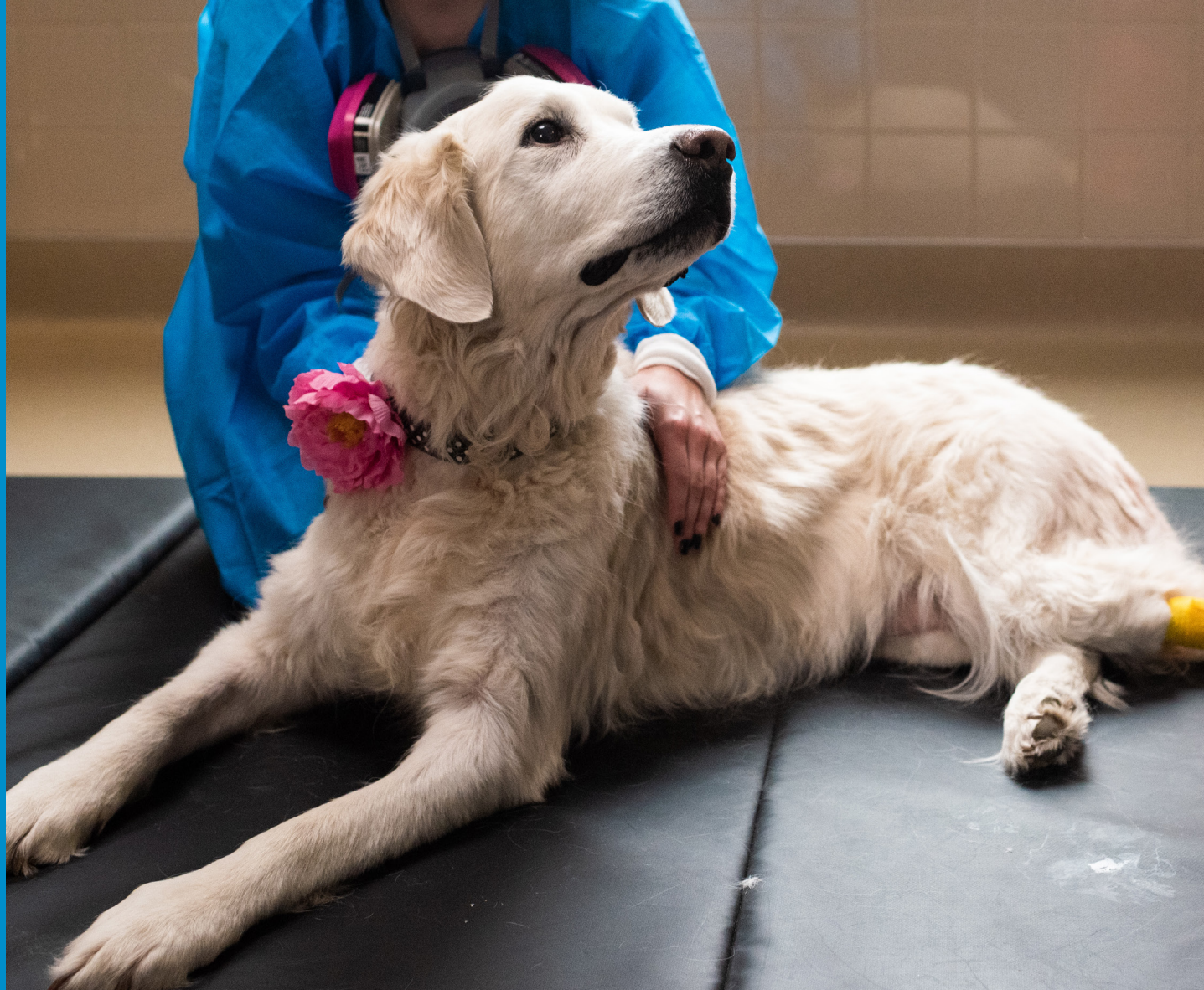
How Smiling Blue Skies Improves Research continued.