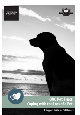
OVC Pet Trust: Coping with the Loss of a Pet — A Support Guide for Pet Owners