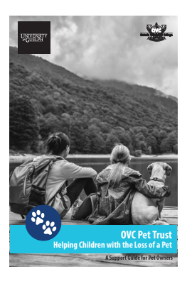
OVC Pet Trust: Helping Children withe the Loss of a Pet

A complete listing of pet loss support materials including: online communities; grief and bereavement resources; pet loss support groups; pet memorial; suggested pet loss books and other online reading materials are also available on our website. Books on pet loss for children can help parents narrate a story around pet illness and death.