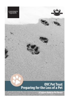
OVC Pet Trust: Preparing for the Loss of a Pet — A Support Guide for Pet Owners